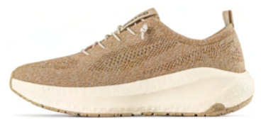
Aura ReWool RB9X MelangeCaramel F0305005