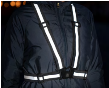
Reflective Harness Black 99811A NOK: 249:- SEK: 249:-