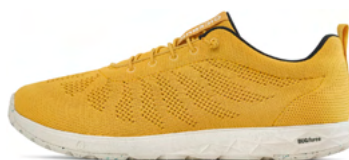
Eli RB9X Mustard F88025-0J