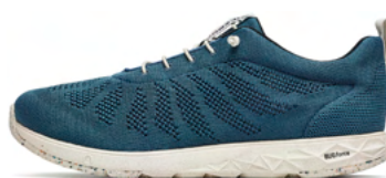
Eli RB9X Steel blue F88025-0B