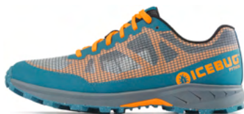
Pytho6 RB9X Petroleum/Orange M: H91001-0B