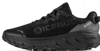
Arcus 2 RB9X GTX TrueBlack M: H73005-0A W: H73006-0A