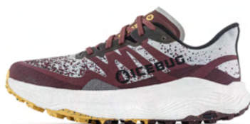
Järv RB9X Dark Cherry/Yellow M: F0304004 W: F0378001