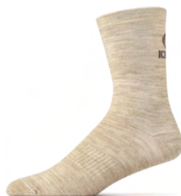
Light Merino Sock Sand X0362003