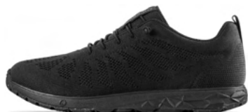
Eli RB9X TrueBlack F0235012

Upper is made of bluesign®, solution dyed and 100% recycled GRS certified PET polyester.