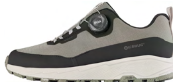
Haze RB9X GTX Clay M: F0263008 W: F0264009