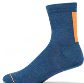
Trail Merino Sock StormBlue 99551B