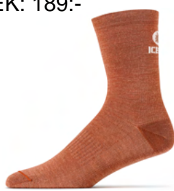
Light Merino Sock Clay X0362002