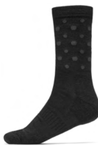
Active Merino Sock Spots Black/Grey 99549A