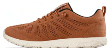
Eli RB9X Terracotta F0235010