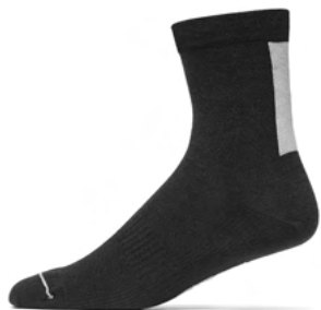
Trail Merino Sock Black 99551A