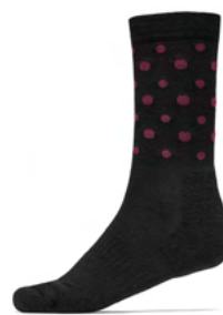
Active Merino Sock Spots Black/Hibiscus 99549B