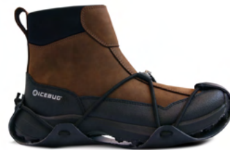
FloorSaver Black I38001 NOK: 349:- SEK: 349:-