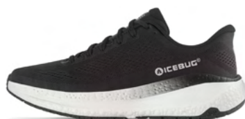
Aura RB9X Black M: I23001-0A W: I23002-0A