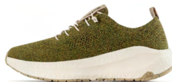
Aura ReWool RB9X MelangeMoss F0305004