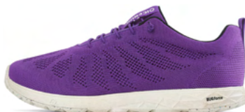
Eli RB9X Violet F88025-0H