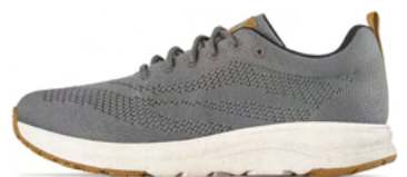
Mosi RB9X SteelGrey I54001-0D