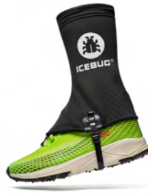
Pocket Gaiter Black B1599C NOK: 499:- SEK: 449:-