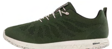
Eli RB9X Olive F88025-0E