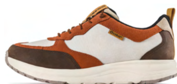
Norna RB9X Oat/Terracotta F0361004