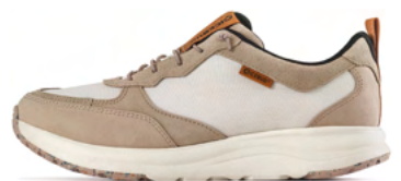
Norna RB9X Oat/Almond F0361005