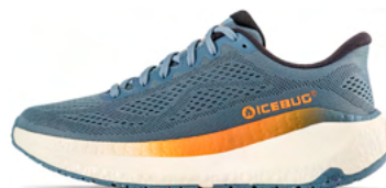
Aura RB9X PigeonBlue/Peach M: F0303005 W: F0304004