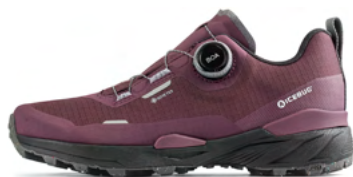
Rover 2 RB9X GTX Hibiscus W: I53002-0B