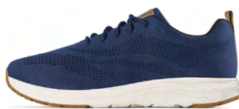
Mosi RB9X DenimBlue I54001-0C