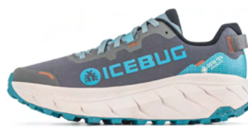
Arcus 2 RB9X GTX MistBlue M: H73005-0B W: H73006-0B