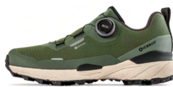
Rover 2 RB9X GTX LightMoss/Black M: F0315003 W: F0316003