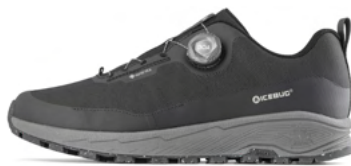
Haze RB9X GTX Black/Granite M: G93009-0F W: G93010-0F