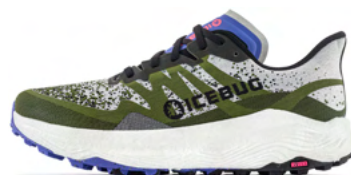
Järv RB9X Pesto/Lavender M: F0324006 W: F0378002