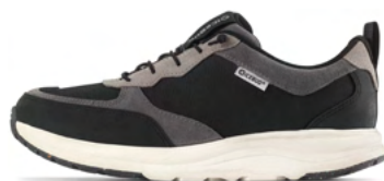
Norna RB9X Black/Grey F0361002