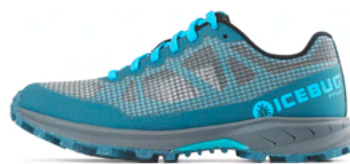
Pytho6 RB9X Petroleum/Aruba W: H91002-0B