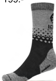
Warm Wool Sock Black / Grey 99550A