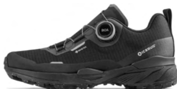
Rover 2 RB9X GTX Black/SlateGrey M: I53001-0A W: I53002-0A