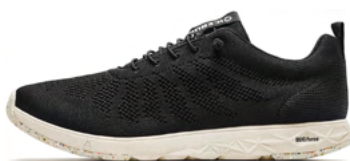
Eli RB9X Black F88025-0A