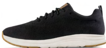
Mosi RB9X Black I54001-0A