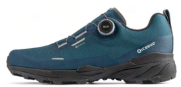
Rover 2 RB9X GTX SteelBlue M: I53001-0B