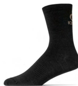
Light Merino Sock Black X0362004