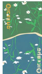
Icetube Reflections X0048004