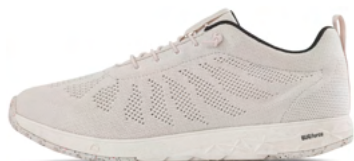
Eli RB9X PearlWhite F88025-0G