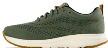
Mosi RB9X Sage F0317004