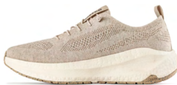
Aura ReWool RB9X MelangeSand F0305003