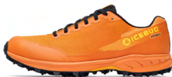
Pytho6 BUGrip Mango/Black M: H89001-9B W: H89002-9B